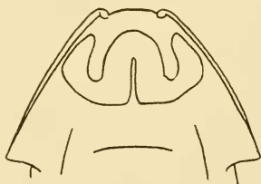
Fig. 1.— Polypus apollyon , outline drawing of funnel laid open along the medio-ventral line to expose the funnel organ. \times 2 . [S. S. B. 81.]

It seems fairly doubtful whether all the specimens included with the type of this species in the table of locality data in my report (Berry, 1912a, p. 283) are in reality conspecific with one another or belong to recognizable groups which only a greater abundance of well-preserved adult material than is at present available will enable us to separate. In the meanwhile I am inclined to recognize P. apollyon as distinct from the true P. hongkongensis Hoyle, a view which, if correct, eliminates the latter species from consideration in our fauna.